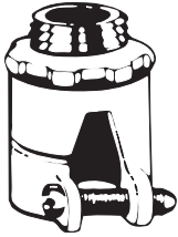
Straight squeeze-type connectors – malleable iron