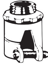
Straight squeeze-type connectors – insulated malleable iron

UL File No. E-1383 1/2"-3/4". UL File No. E-23018 1"-3".